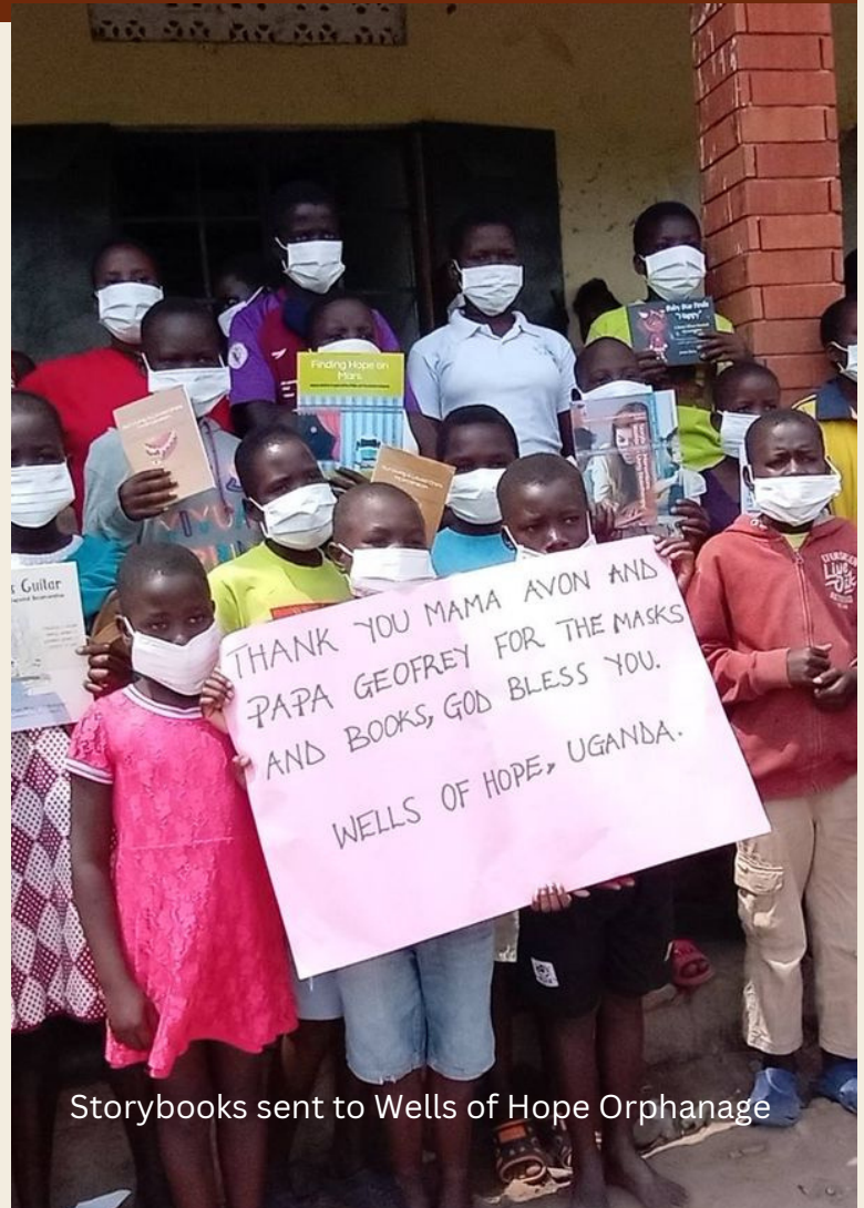
Storybooks sent to Wells of Hope Orphanage

American University Arizona State University Advocacy in Action Coalition Capitol Hill Community Foundation Catholic Charities Community Family Life Services C.U.R.E. DC Department of Corrections Eastern Illinois University Fairview Residential Reentry Center Ford Foundation George Washington University International Coalition for Children With Incarcerated Parents International Prisoner Family Conference Love Beyond the Walls Mayor's Office for Returning Citizens Affairs National Organization for Returning Citizens Osborne Association, SUSU Prisoner Family Alliance Restore Together Rethink Justice DC Reentry Action Network (RAN) Sigma Phi Nu St. Augustine University University of Wisconsin Madison Valley Green Community and DC Health Department Voices for Second Chance Wells of Hope