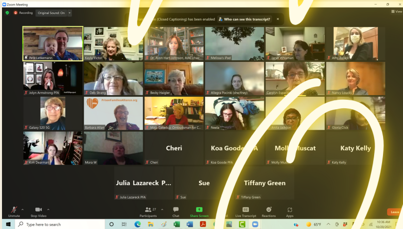
Prisoner Family Virtual Conference