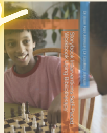
Dept. Of Corrections Workbook