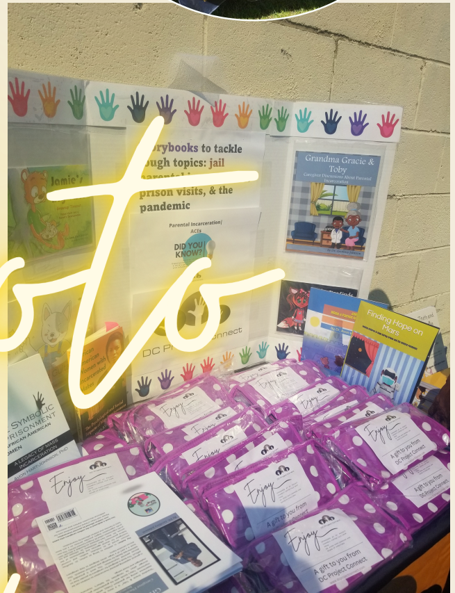
Fairview Residential Reentry Center - Gifts & Books event